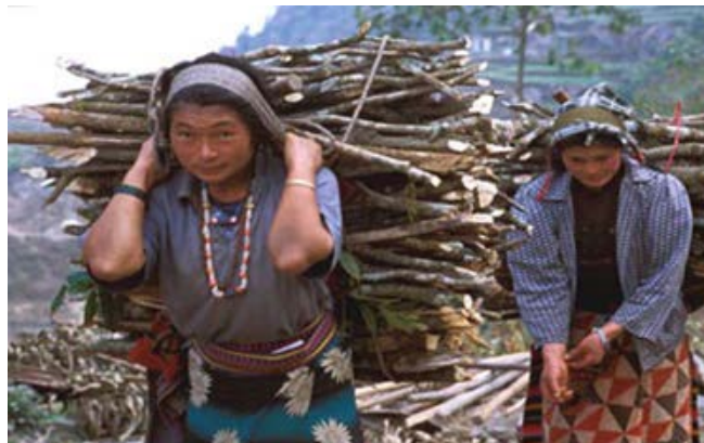
Typical health risks: exposure to smoke and the collection of fire wood.