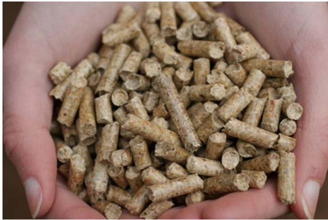
Pellets made from waste wood.

Some types of stoves are optimised for particular types of fuel. An example is an Indian product, which is designed specifically to burn rice husk. It is a batch-type, top-lift updraft (TLUD) gasifier stove.