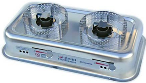
Ethanol cooking stove.

Other fuels include alcohol (methanol in liquid or gel form), locally produced biogas, liquefied petroleum gas (LPG) and compressed natural gas (CNG), for which stainless steel-containing equipment is also available.