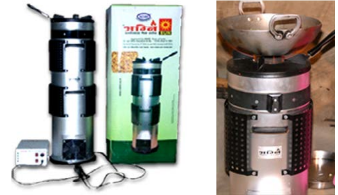
Rice Husk Gas Stove.