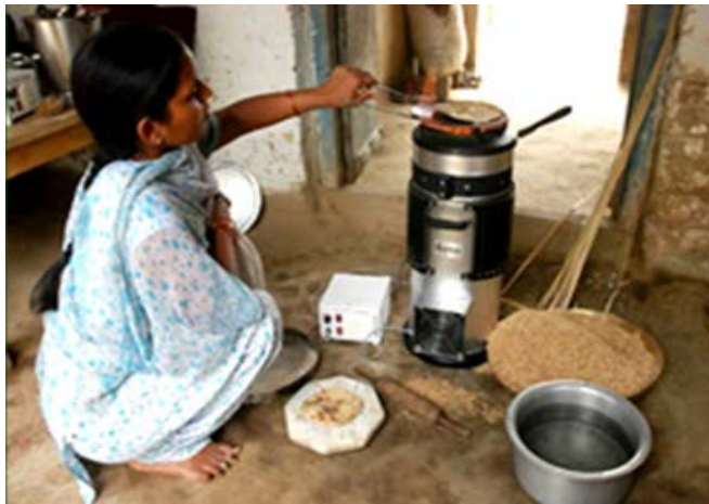
Rice Husk Gas Stove.

Government programmes now ask manufacturers to test their appliances for particulate matter and CO 2 emissions and thermal energy output so consumers can compare alternative methods and models available in the market.