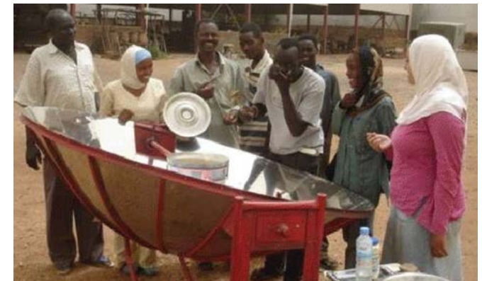
Stainless steel parabolic dish for solar cooking stove.