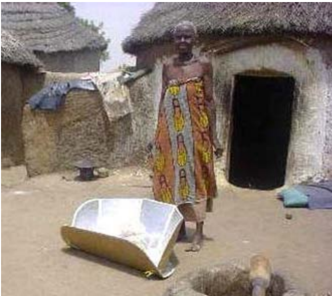
Basic panel cooker involving a metal foil on a cardboard support.

Panel cookers depend on the same physical principle, but, they involve foldable reflectors. Experience shows that they can produce temperatures of 120 °C to 180 °C (approximately 200 to 300 F). Basic models are common in developing countries; but the principle has also spread to industrialised countries, where the “hot pot” has become a lifestyle article.