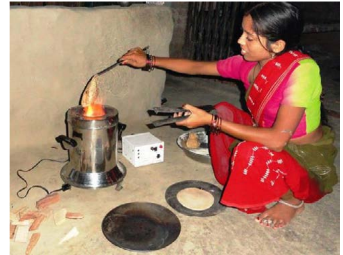
Forced air stove with electrically powered fans and rechargeable batteries for use with photovoltaic cells.

The 50% lower fuel consumption, together with shorter cooking times, lead to a 70% reduction in smoke compared to simple open stoves. The enhanced combustion also minimises particulate matter formation and the unsightly blackening of kitchen walls and cooking pots.