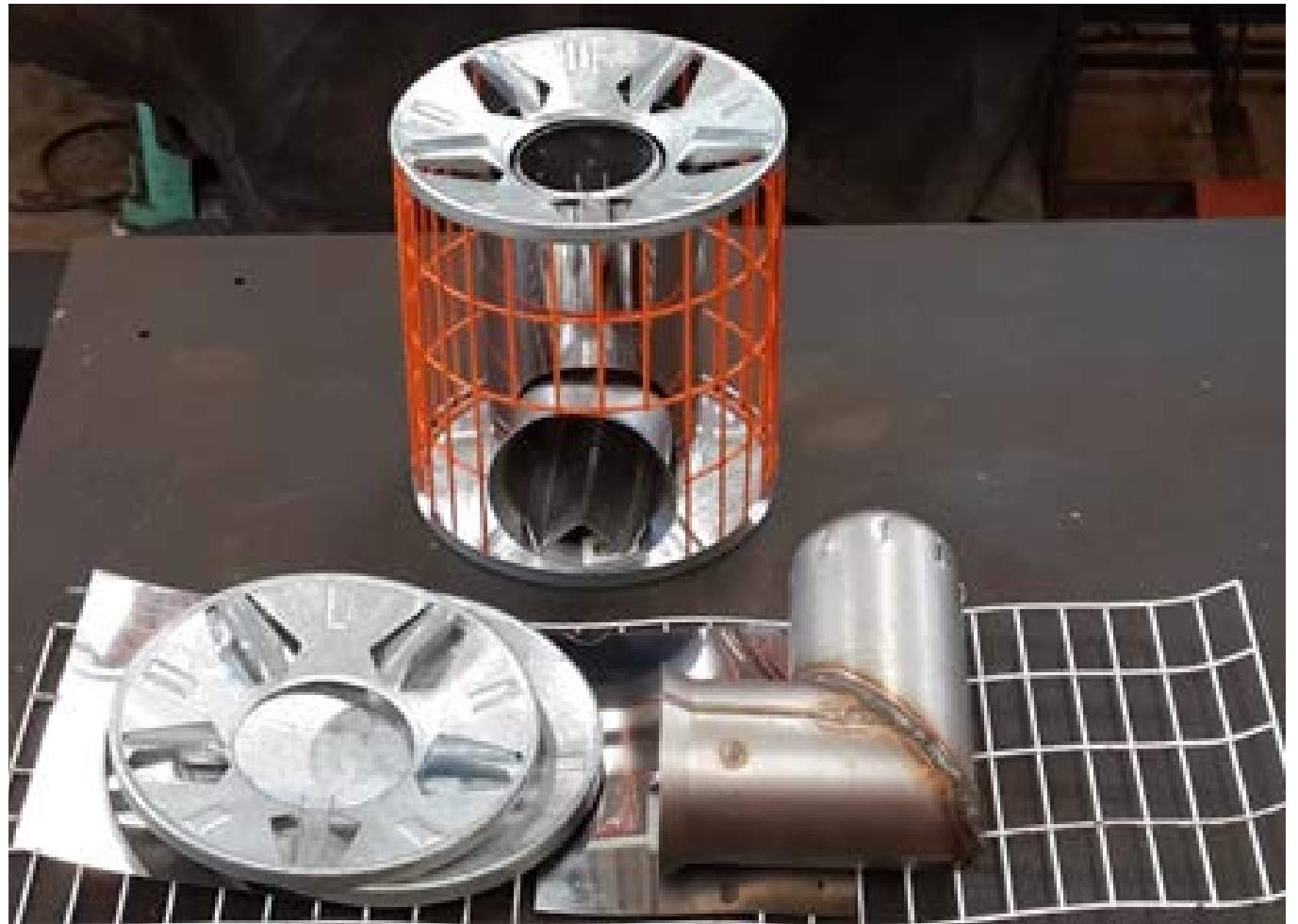
L-shaped combustion chamber of a rocket stove, assembled (above) and as delivered in a flat pack.