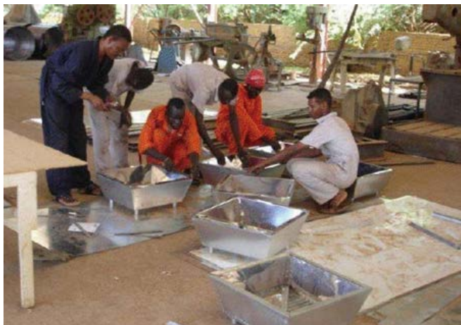
Solar box cookers.