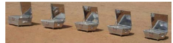
Solar box cookers.

Further development potential lies in the fact that the principle is also successfully applied to domestic hot water systems, water distillers, food dryers and large-scale community kitchens. Some of the biggest units can be found in India, where they produce hot water and steam for the preparation of three meals a day for a thousand people.