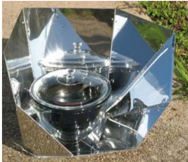
All-metal panel cooker.

In the case of box cookers, the lid is made of a mirror-like material. It reflects the solar radiation into a blackened box, into which the cooking pots are placed. Box cookers are bigger and less portable than panel cookers, however, larger models can hold several cooking pots. The temperature range is typically between 180 °C and 200 °C (about 350 to 400 F).